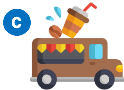
At Aeria station, straight ahead