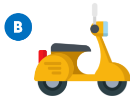
At Dockworks C station, left side