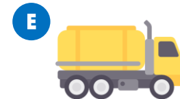
At Garland station, straight ahead