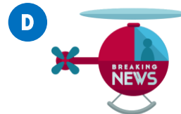
At hospital station, left side