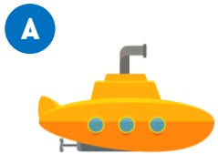
At Tarth station, right side

EXAMPLE For the first image you write, “At Tarth station, Andre saw a submarine on the right.” in Kristang.